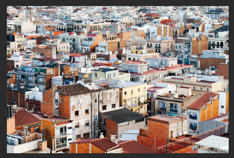
With South America thrown in throughout!