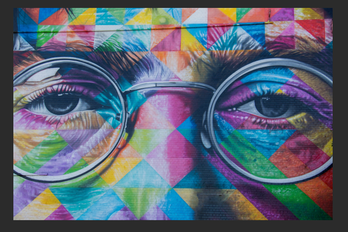
From Oxford to Bristol