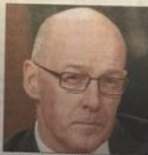
JOHN SWINNEY: Wants to give more power to headteachers.

raised similar concerns after a public meeting attended by government officials.